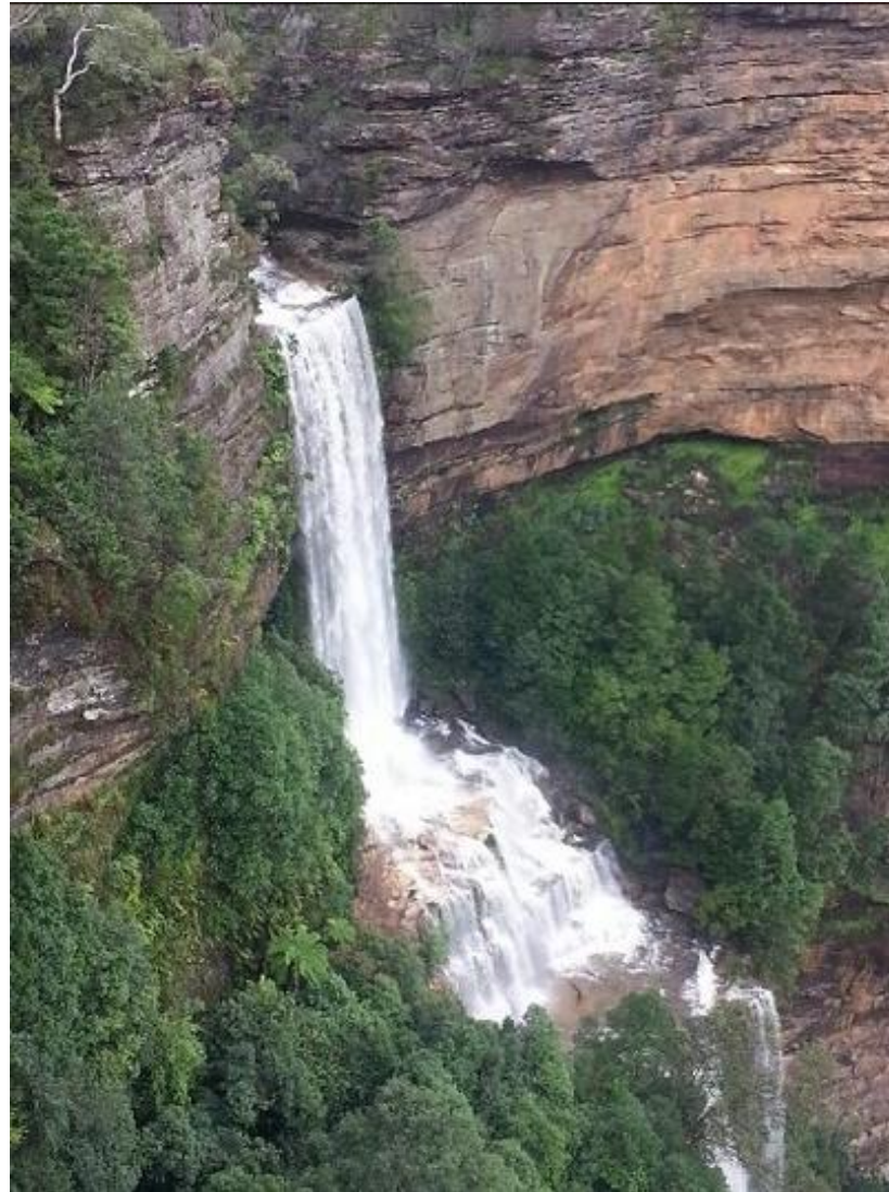
Katoomba Falls in 'full flight' after heavy rains upstream in Katoomba Falls Creek Valley water subcatchment. 3