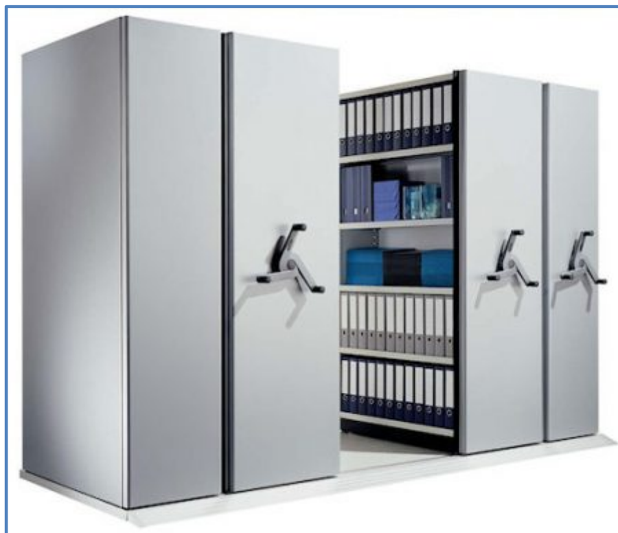
PROPOSED: An Archive Compactus Unit, being a state-of-the-art, large capacity, secure storage unit 6